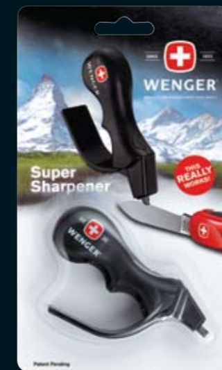
6 18 00 Sharpener Pull-Through