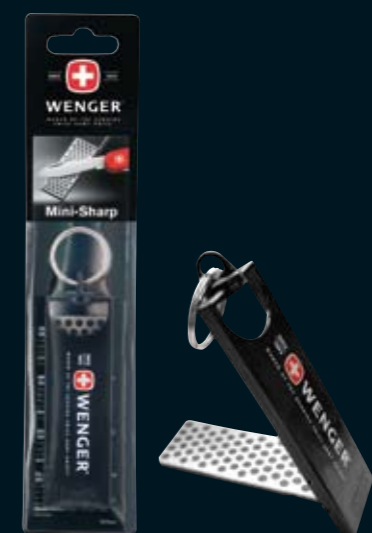
6 18 01 Pocket Sharpener