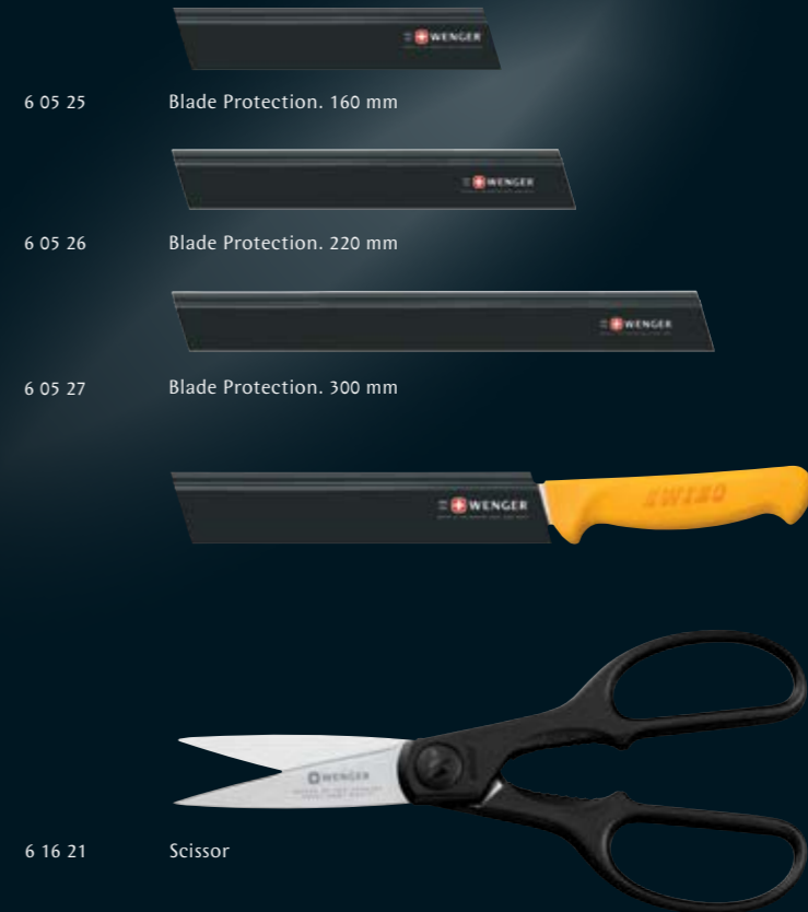
6 05 25