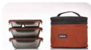
TOGO FLORA L SET NO.2 CEC4-206