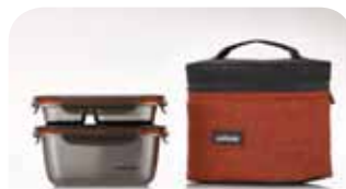
TOGO FLORA L SET NO.1 CEC4-205