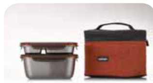
TOGO FLORA M SET NO.1 CEC4-203