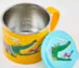
INFANT CUP 300ML

L 180 x W 124 x H 86 capacity 650 mL | weight 212 g CEC10-104Y