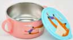
INFANT FEEDING BOWL 650ML

L 151 x W 122 x H 58 capacity 400 mL | weight 164 g CEC10-103Y