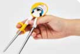
INFANT TRAINING CHOPSTICKS

L 150 x W 34/25 x H 15 Weight 31/23 g CEC10-302Y