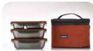
TOGO FLORA M SET NO.2 CEC4-204