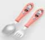
KID SPOON & FORK SET

L 152 x W 74 x H 20 Weight 123 g CEC10-301Y